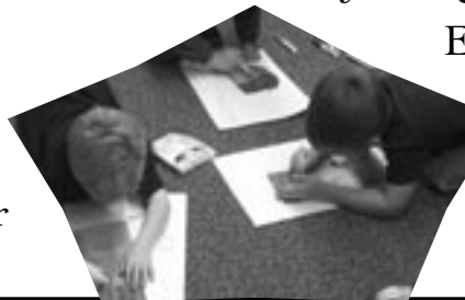
Everyone is coloring their pumpkin sacks.