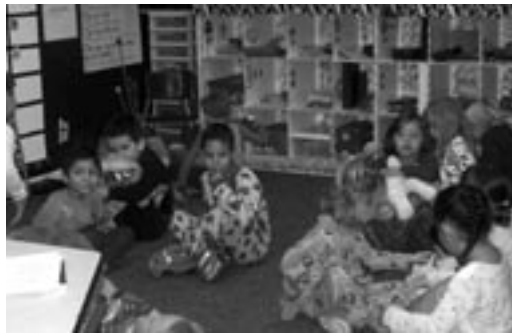
The class is getting settled