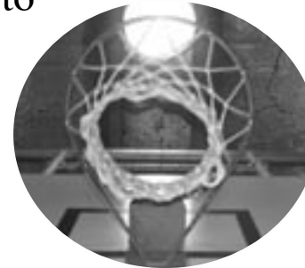
Just hangin' around

In P.E. we are learning to dribble yo-yos, shoot lay-ups, and pass the ball around.