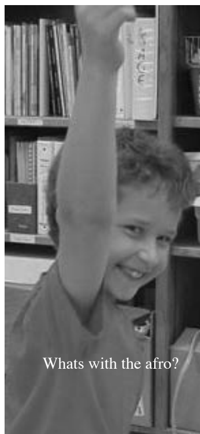
Whats with the afro?

Knock, Knock Who's there? RV RV who? RV there yet??!