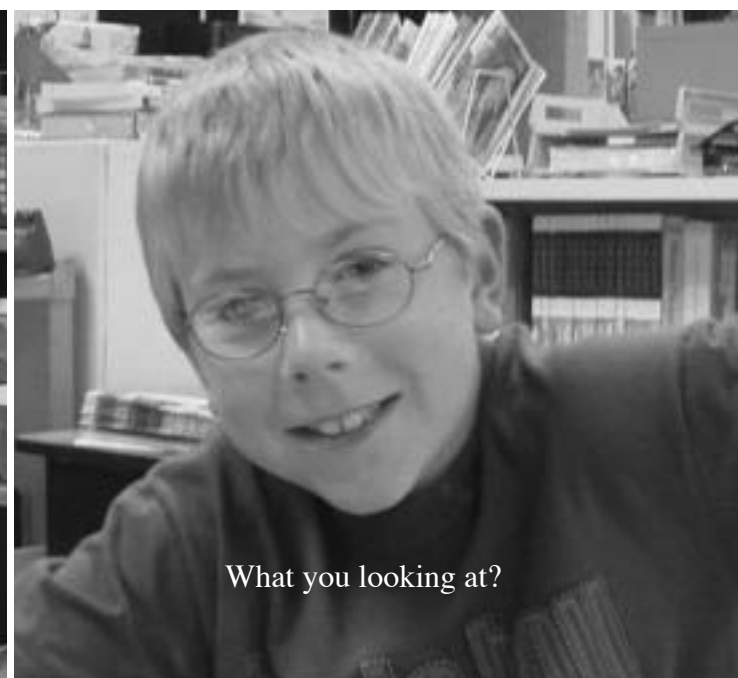
What you looking at?