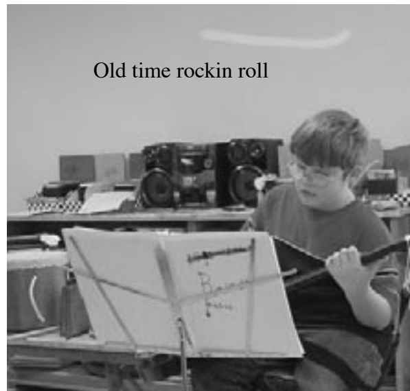
Old time rockin roll