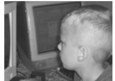
The kids really like playing on the computer.