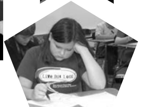
They are studying fractions, adding, and subtracting fractions proportions. The 6th grade class is really excited about there new smart board. They are also excited about the new class rooms.